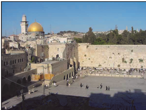
Al Aqsa Mosque & Western Wall - Jerusalem